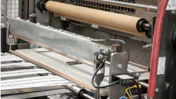
Seal bar design offers precise heat control and fast impulse sealing technology. Narrower transfer allows for running smaller product across the bar.