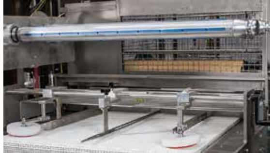
Pneumatic film spindles expand to hold the film in place without damaging the cardboard core and allow for plastic cores.