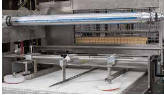
Pneumatic film spindles expand to hold the film in place without damaging the cardboard core and allow for use of plastic cores.