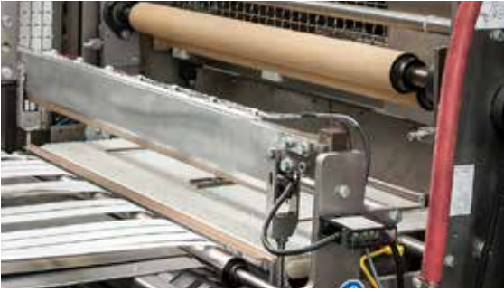
Seal bar design offers precise heat control and fast impulse sealing technology. Narrower transfer allows for running smaller product across the bar.